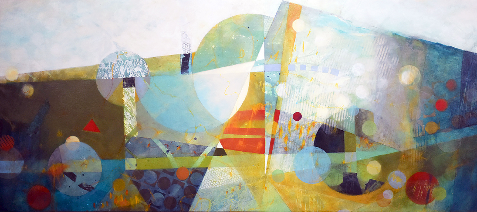
Precipice | Mixed Media Collage | 24" x 54"