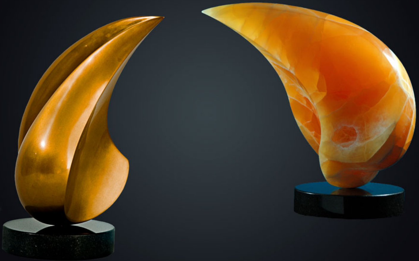
Eternal Flame | left: Bronze Casting, right: Honeycomb Calcite Carving | 14"

Gass' work often takes on an intentionally representational form, but the form itself is the most important aspect. The subject matter of the piece is secondary to the form. This is not to say that the subject matter is unimportant, but rather that it is the form that gives the piece its power.